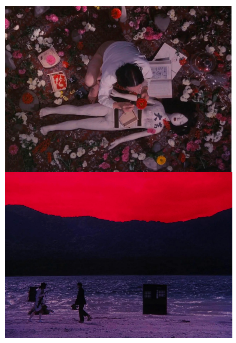
Film stills from Shūji Terayama's 1974 Drama fantasy film titled Pastoral: To Die in the Country.