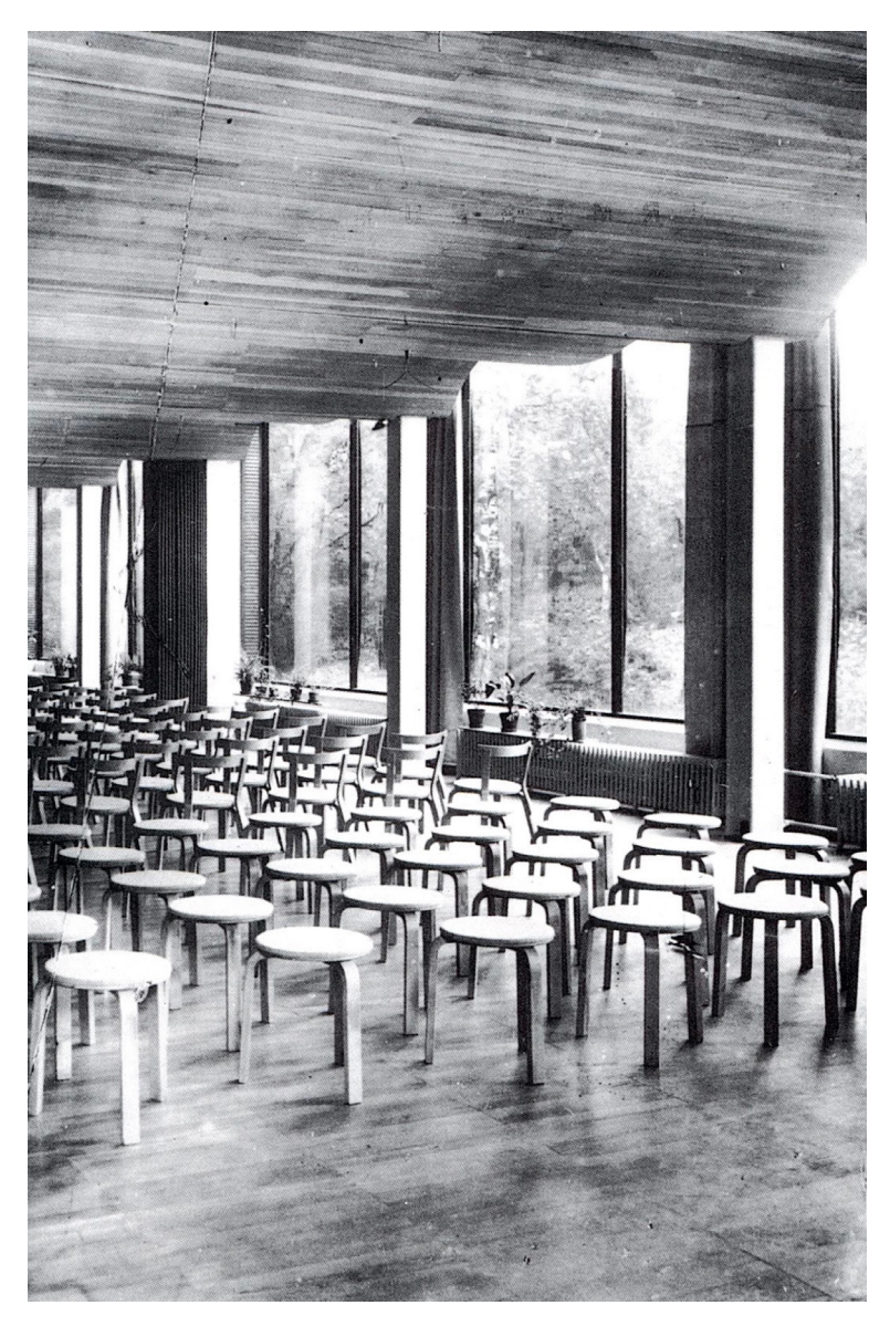
Viipuri Library by Alvar Aalto, library lecture Hall.