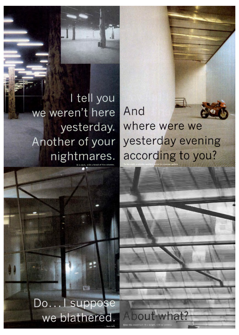
Fragments of book S,M,L,XL. Where cinema and architecture intervene.