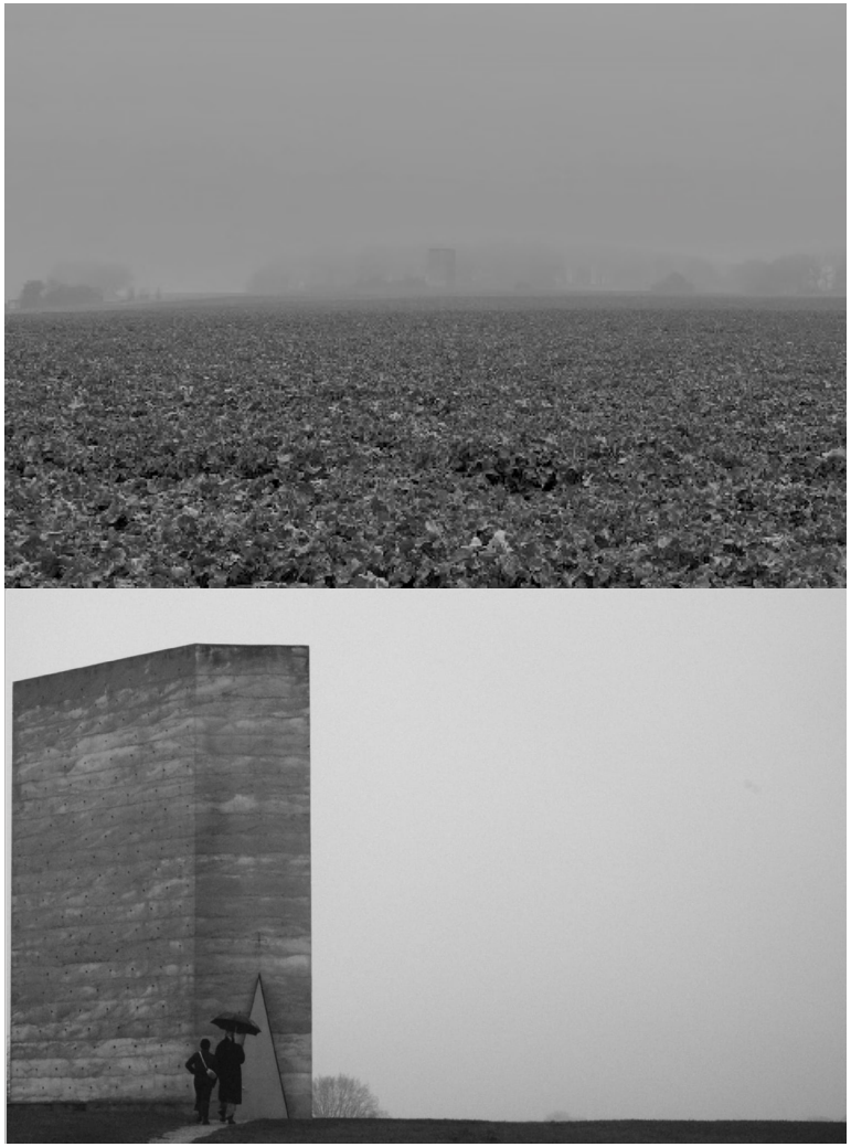
I feel the steel handle between my fingers and the cold rises from my hand to my arm.

The drizzle of rain from which the umbrella cannot protect me from, seems to kiss the surrounding treetops and lay a soft blanket on the meadow.