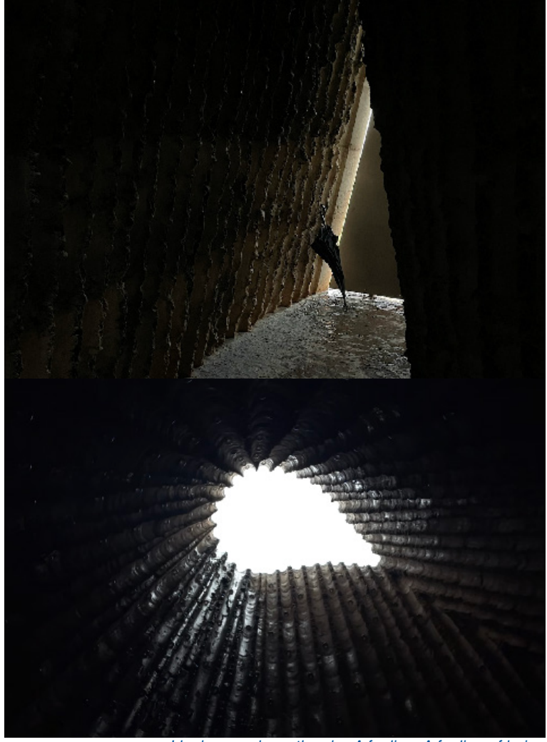
I look up and see the sky. A feeling. A feeling of being.