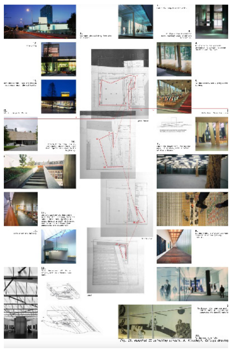
Kunsthal Rotterdam has a complex linear route expressed in an architectural storyboard by OMA.